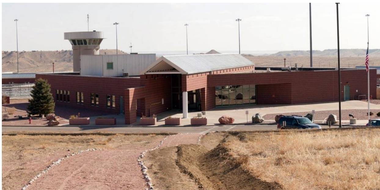
USP Florence ADX